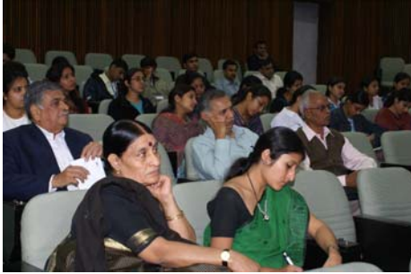
View of Participants