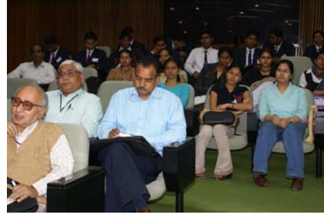
View of Participants