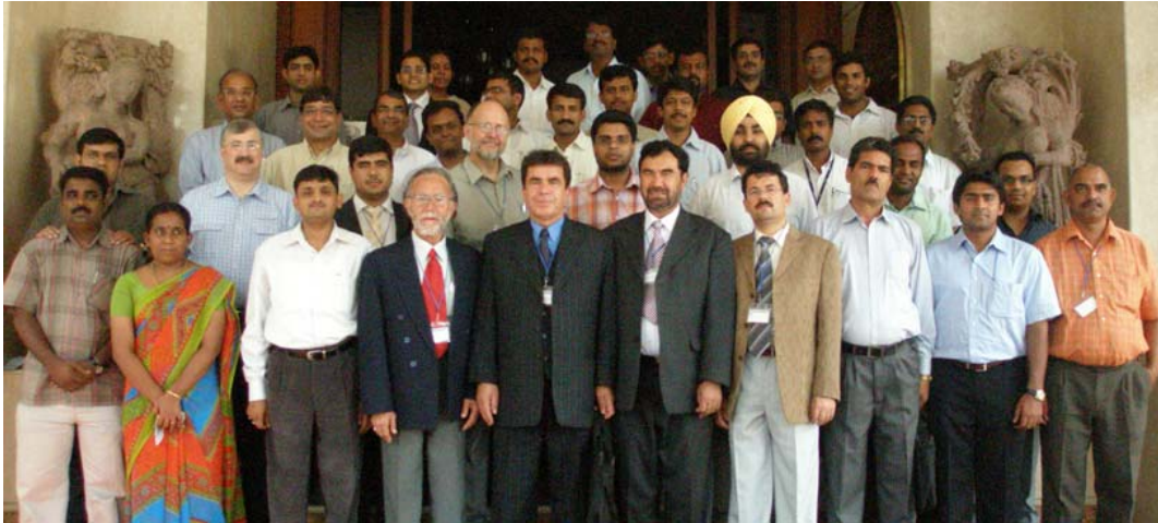
Participants of Short Course at Chennai