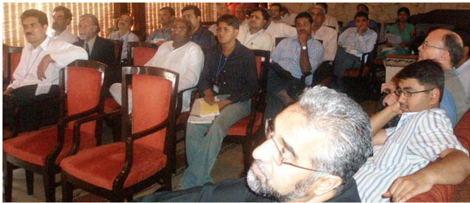
Participants of Ahmedabad Seminar