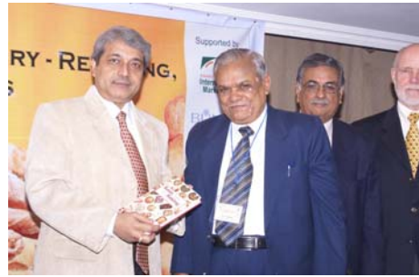
Releasing of Basic Baking